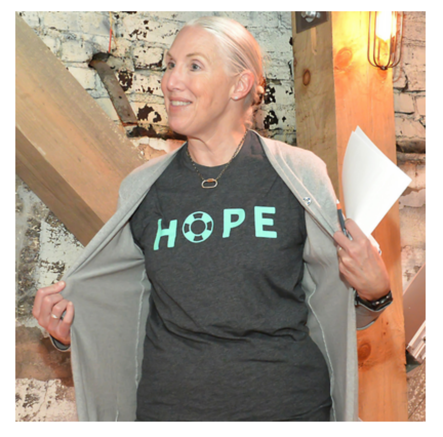
Did you know September is National Suicide Prevention Month? After Hours welcomed