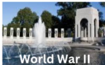
World War II