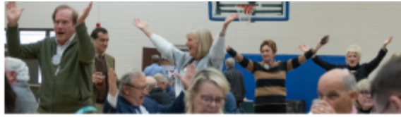
Dancing to Get the Meeting Started