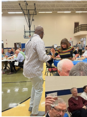
Chair Dancing to One Margarita!