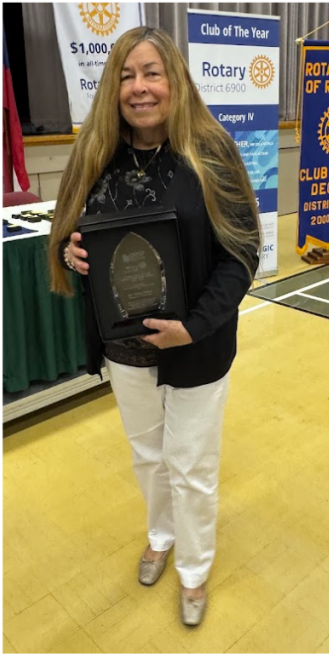
Frank E. Bentley District 6900 GRSP Leadership Award