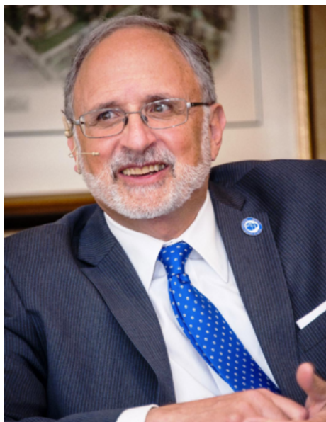
President, The World Affairs Council of Atlanta